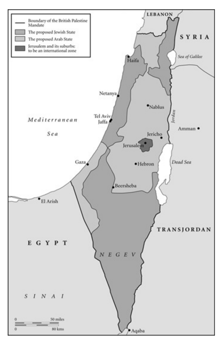
Map 4 The United Nations Partition Plan, 1947