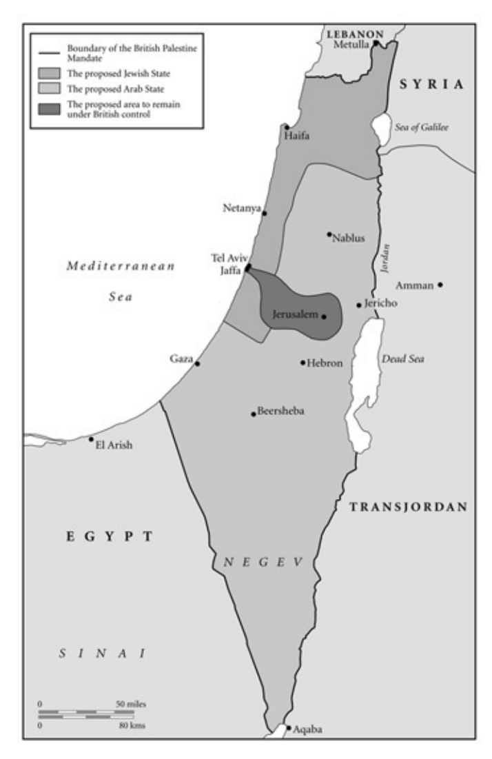
{f Map~3} The Peel Commission Partition Plan, July 1937