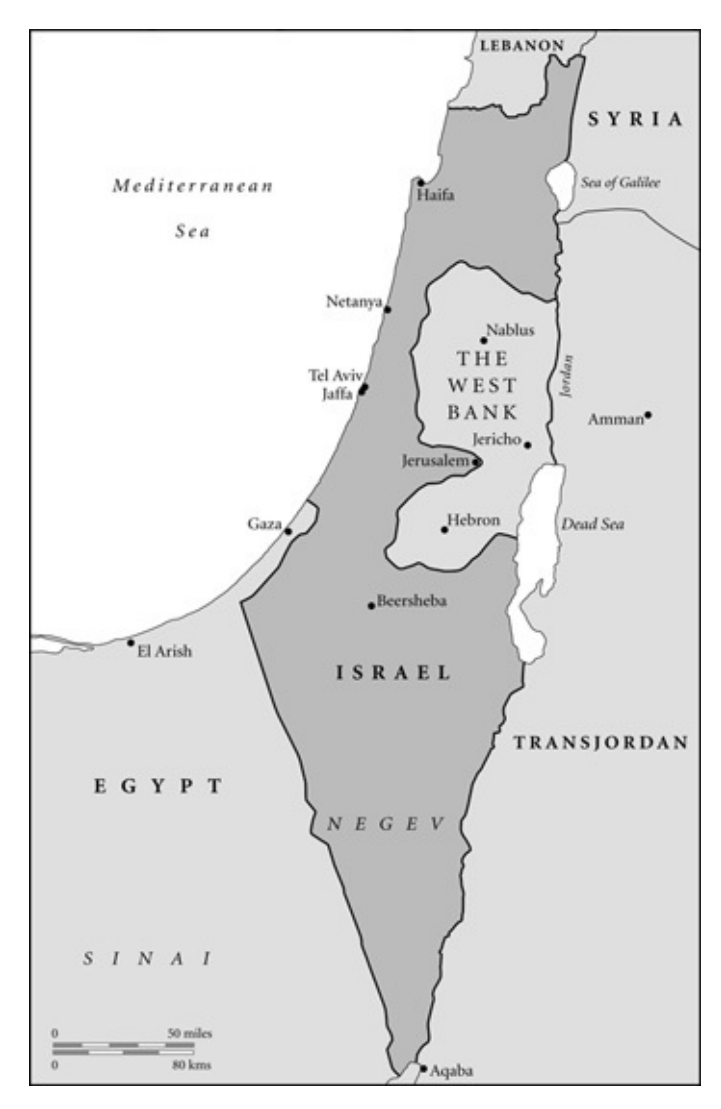
Map 5 The 1949 Armistice Lines