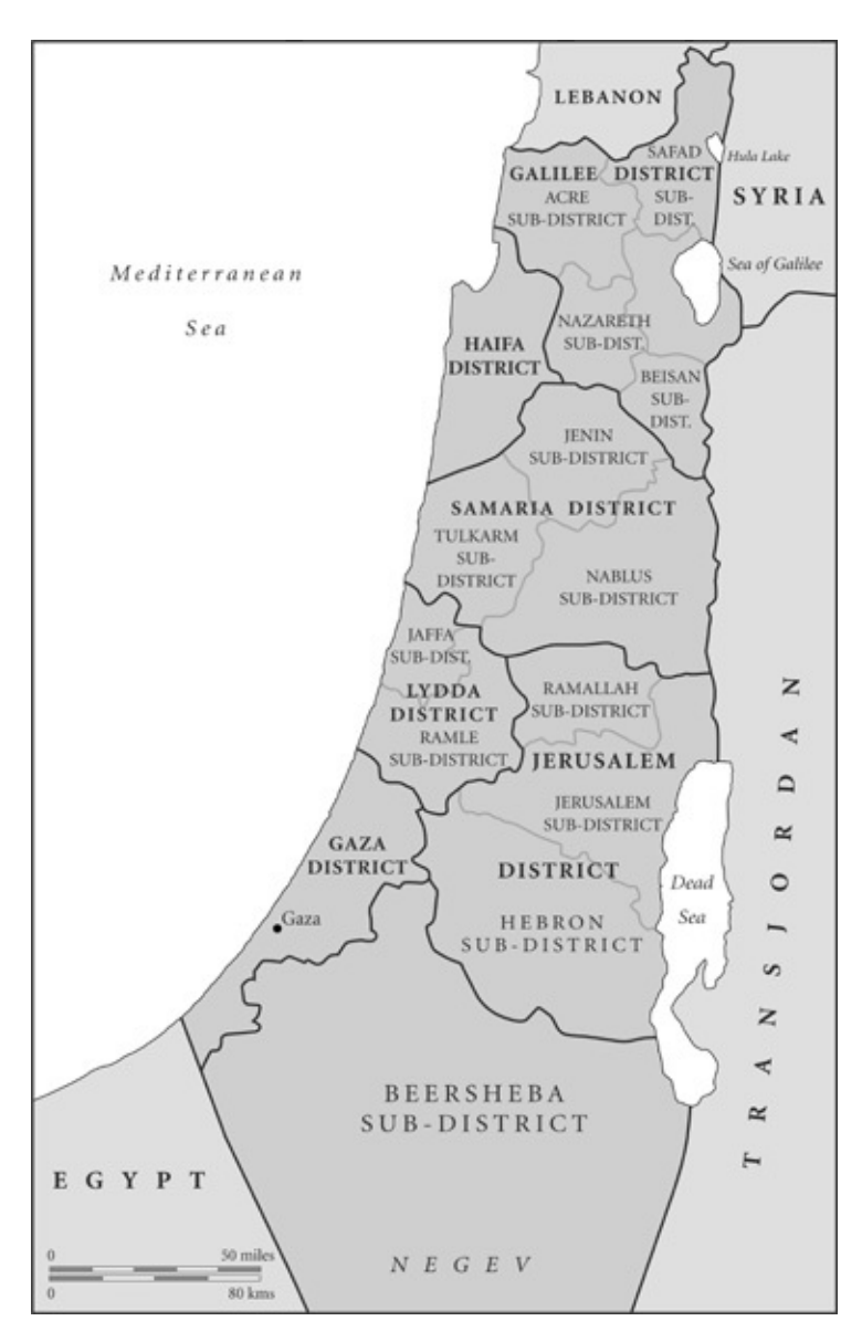
Map 1 Mandatory Palestine Administrative Division (1920–1948)